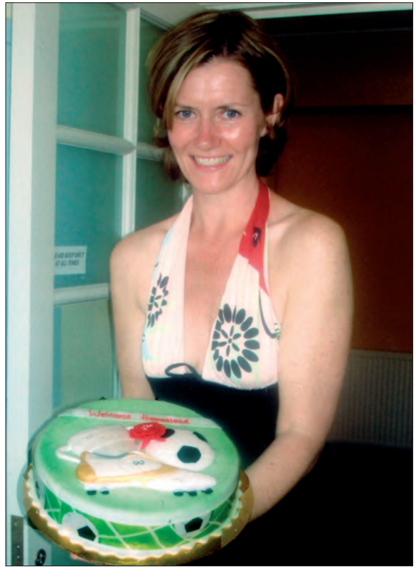
Battle pictures overleaf...